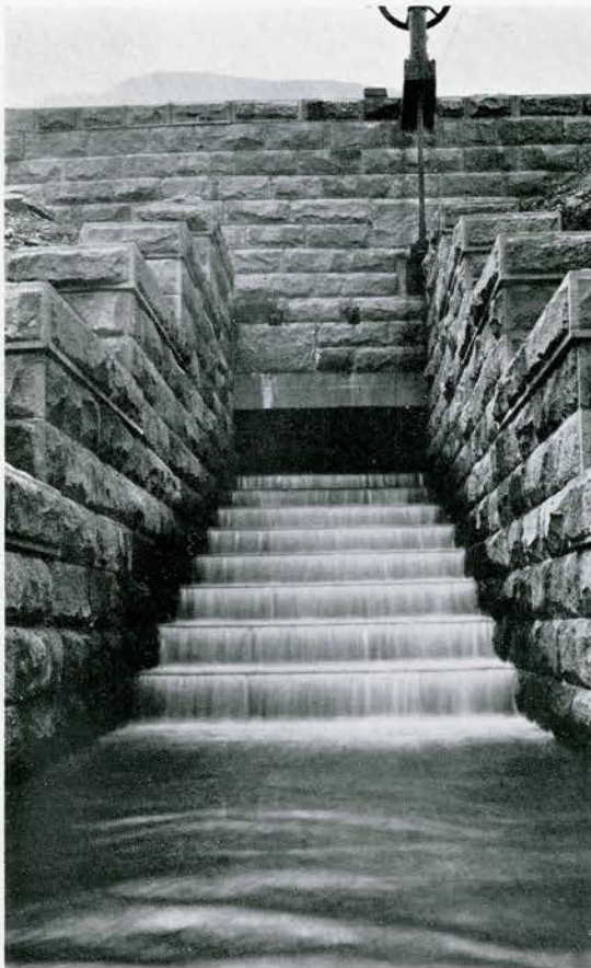
Outlet from pool below primary leaping weir at Yeoman Hey embankment. The secondary leaping weir is situated immediately below, and it is possible to discharge the water flowing from the pool either into Yeoman Hey reservoir or into a conduit connected to the filter house.

September the 4th, 1931, was such a day. Rain started falling at 7-0 in the morning, and continued without cessation until 4-0 in the afternoon, during which time three inches and a quarter were recorded.