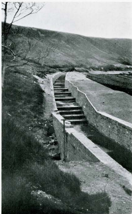
Detritus intercepting pit and sluice valve constructed at the intersection of the gullies with the line of bye-pass.

The flood water course, which is one mile in length, bye-passes the water from the Greenfield Bywash and discharges below the Yeoman Hey embankment into Greenfield Brook.