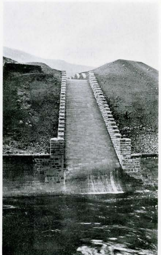
MASONRY CHUTE AT GREENFIELD BROOK.

The Valley is a poet's sanctuary on a quiet summer's afternoon, but when the poet has gone and forgotten Greenfield Valley, and