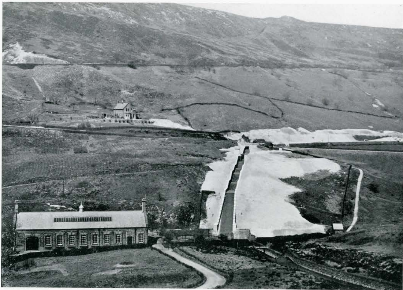
After the separation of the water the bye-pass descends to Greenfield Brook by means of a series of flights of steps and finally discharges into the Dovestone Clough cascade pool down a masonry chute. The contraction of the channel shown near the top of the photograph increases the depth of water behind it, this increase being a measure of the quantity of water flowing in the channel.